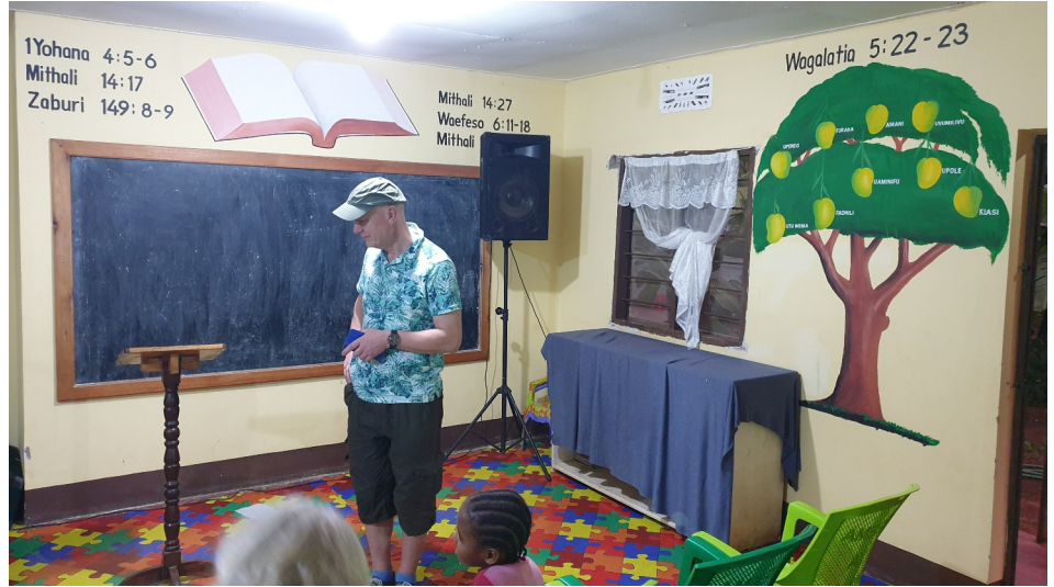
Newly decorated worship room