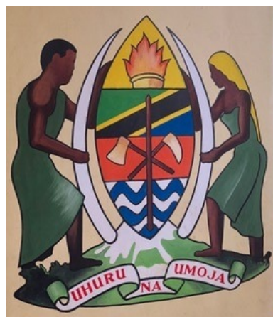
'Freedom and Unity'