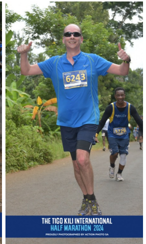
'Fun run' - Kilimanjaro Marathon 25.3.24