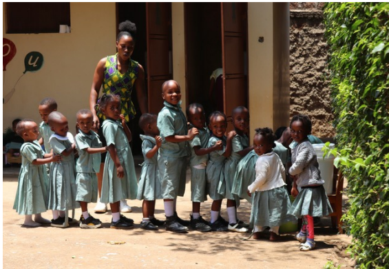
All Together now

Two years ago, one of the children was invited to live permanently with a relative. Sadly, the relationship recently broke down and arrangements are now being made, through social services, to return her to Kitaa and therefore to boarding at secondary school, as a safe place. It may not be enough but it is the best we can offer.